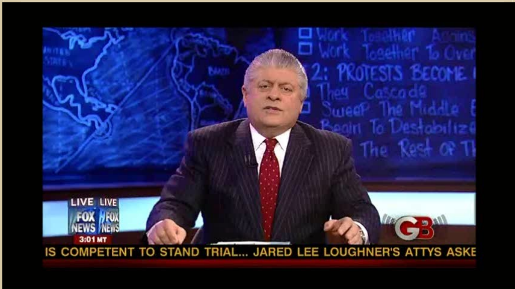
Congressmen Allen West (R - FL) & Connie Mack (R - FL) Excerpt from the Glenn Beck Show, Fox News, March 9, 2011